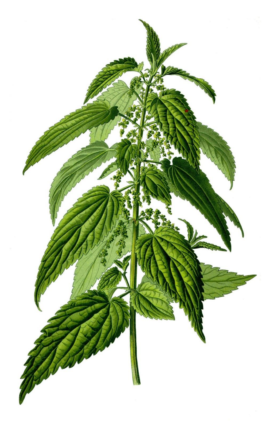
Drawing source: Prof. Dr. Otto Wilhelm Thomé Flora von Deutschland, Österreich und der Schweiz 1885, Gera, Germany